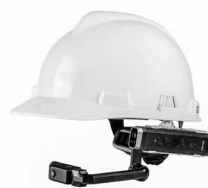
Safety frame mounting accessory (PPE Compatible)