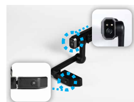
Dual camera, main camera (16MP) and secondary camera (8MP)