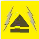
Quick release, HDD