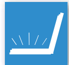
Backlight function 1)