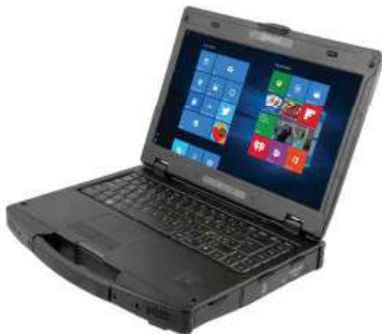
Waterproof keyboard with optional backlight function