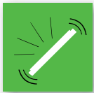
Solid compact design