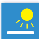
Sunlight readable screen 1)