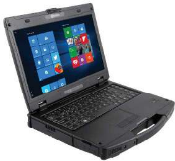
Solid compact design